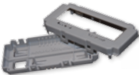
Electronic housing prototype printed in Accura Xtreme