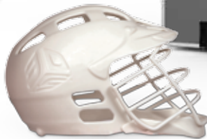
Helmet model printed in Accura Xtreme White 200