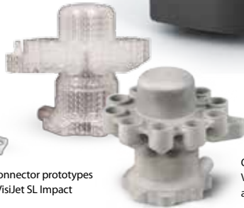
QuickCast® pattern in VisiJet SL Clear, and aluminum casting