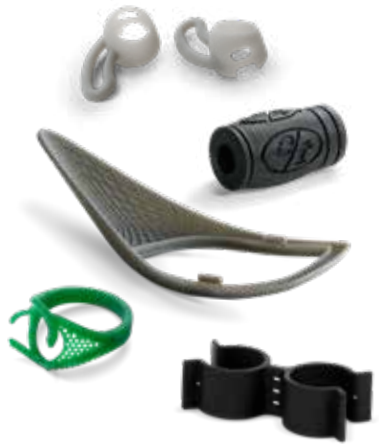
Figure 4™ TOUGH-GRY 10

Create parts that combine high resolution with exceptional surface quality and mechanical properties from a variety of robust materials. Materials available for Figure 4 Standalone include a broad and expanding range of industrial materials, including cast and elastomeric materials. Quick and easy material changeover allows for functional prototyping and production application versatility with the same printer.