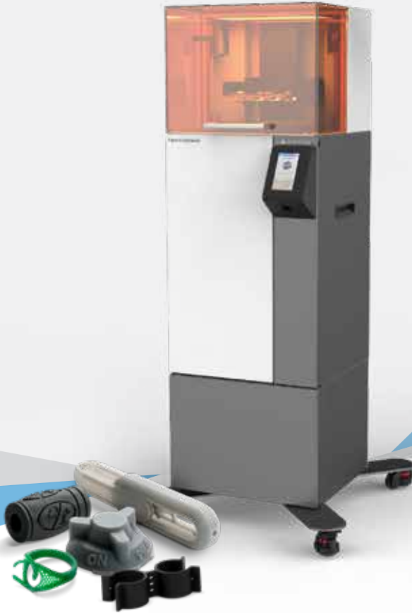
Figure 4 ® Standalone

Ultra-fast and affordable industrial 3D printer